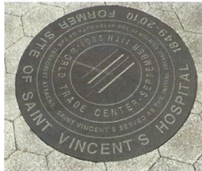
9/11 World Trade Center