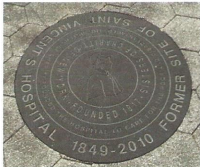
Sisters of Charity

There are medallions imbedded in the pavement of the park commemorating some of the most significant contributions made by St. Vincent's to the community.