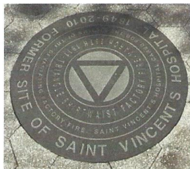
Shirtwaist Factory Fire